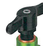
Blank-run design rotating handle