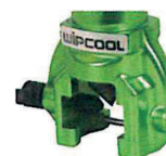
Ultralight high strength aluminum T gantry

Can used with ≤14.4V Power Tools For Fast Flaring