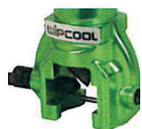
Ultralight high strength aluminum T gantry