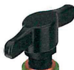
Blank-run design rotating handle