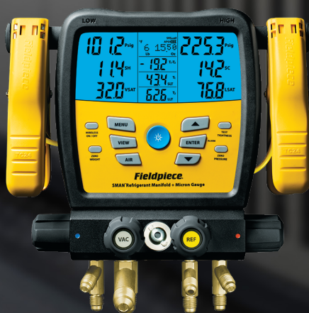
Refrigerant Manifolds SM480V, SM380V