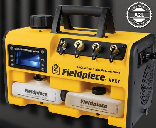
Vacuum Pumps VPX7, VP87, VP67