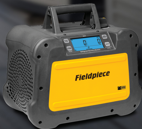
Recovery Machine MR45